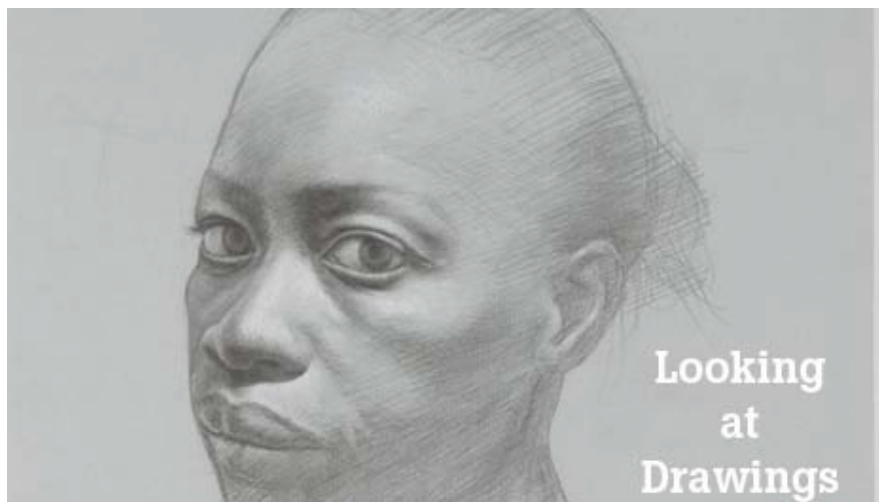
Looking at Drawings