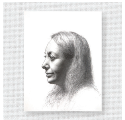
Jenne I | 14 x11 inches | graphite on paper

TO LEARN MORE ABOUT THE ARTIST, VISIT COSTAVAVAGIAKIS.COM