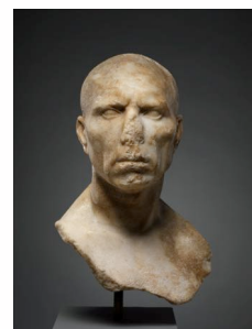
Marble portrait bust of a man