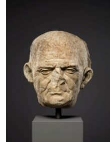
Marble portrait of a man from a