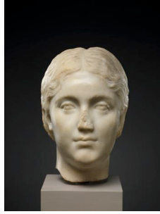
Marble portrait of a young woman