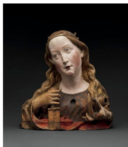
Reliquary Bust of Saint Catherine of Alexandria