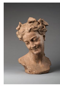
Bacchante with lowered eyes