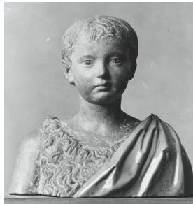
Boy Saint John