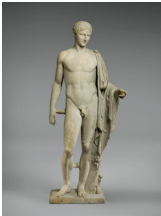
Marble statue of Hermes