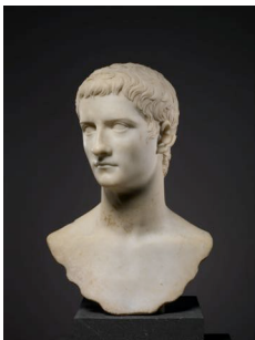
Marble portrait bust of the emperor Gaius, known as Caligula