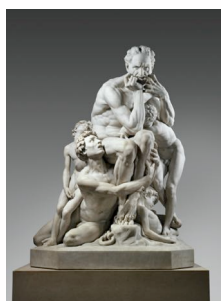
Ugolino and His Sons