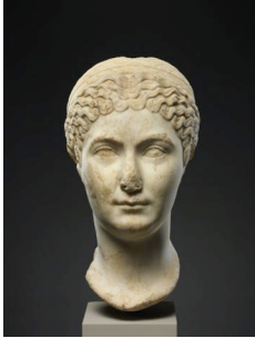
Marble portrait of Matidia Minor