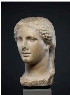
Marble head of a Ptolemaic queen