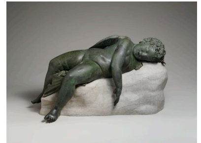
Bronze statue of Eros sleeping